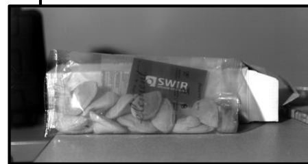
a. Acuros 1920 CQD SWIR Camera image with Backlight