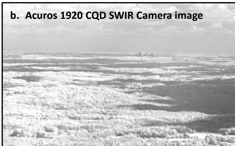
b. Acuros 1920 CQD SWIR Camera image

Images captured via SWIR Vision Systems Acuros ® CQD ® 1920 SWIR Camera with TEC and a 100 mm SWIR coated lens at ~5ms exposure time